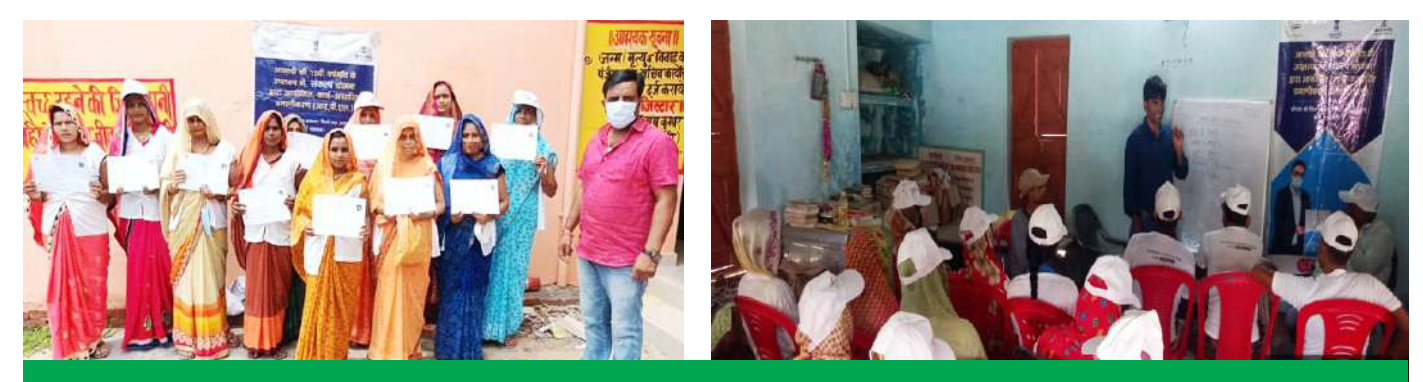
Glimpse of training & Certification Programme under Adarsh GRAM – SANKALP Programme