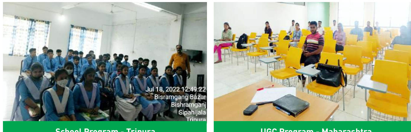
School Program - Tripura

Under Samagra Shiksha, various states are running Agriculture courses from 9<sup>th</sup> to 12<sup>th</sup> class. Since Jul'2022, approx. 650 candidates have been assessed in State of Tripura. The courses covered were Solanaceous Crop Cultivator and Animal Health Worker.