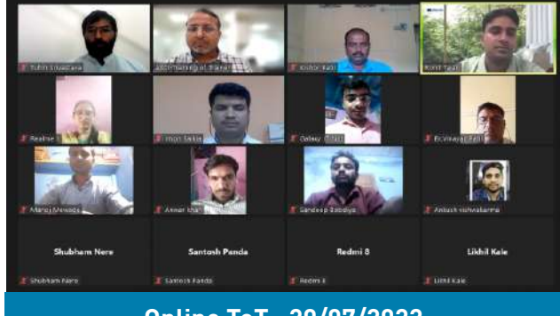
Online ToT : 20/07/2022